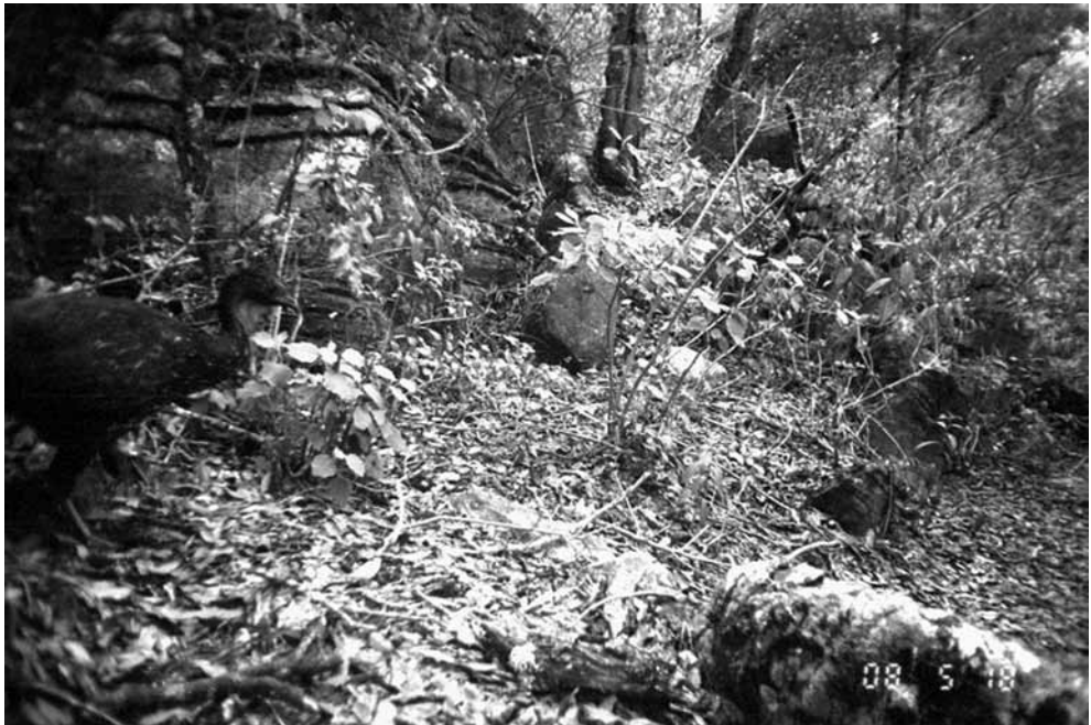
Figure 2. Picture of the Crested Guan Penelope purpurascens taken with a camera-trap in an oak forest at the Sierra Gorda of Guanajuato Biosphere Reserve.

Near Guanajuato, in the state of San Luis Potosí, the Crested Guan was observed in the locality of San Nicolás de los Montes in the municipality Tamasopo (Vargas 2006; Fig 1) and the community of San Rafael in the municipality of Xilitla (Juárez 2008; Fig 1). Another recent observation near Guanajuato was recorded in Cañón del Tigre, Tamaulipas (Brush 2009; Fig 1).