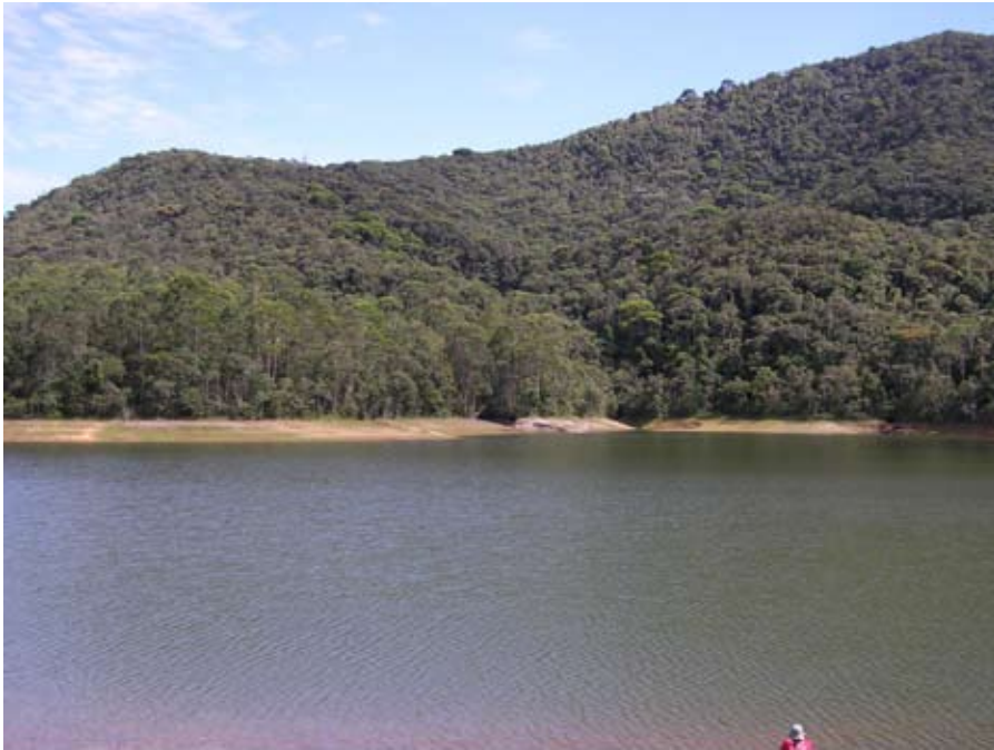
Figure 1. View of the forest (background) at the Itacolomi State Park (Ouro Preto county, Minas Gerais) in which F. sporadochaetus was found, with the Bacia do Custodio in the foreground.

Internal characters: Anterior septa 6/7-10/11 muscular, following septa very thin until septa 13/14, 13/14-22/23 with thickened white dorsal sections, septa 13/14-18/19 fused dorsally. Gizzard in vi, calciferous glands paired in xii, of intertwined tubular structure. Typhlosole lamellar in sinuous zig-zag folds of large amplitude from xvii-xxi, smaller amplitude but depth of lamella approximately constant, never folded over in pockets fused to a central linear part of typhlosole. Hearts vii-ix lateral, x-xi esophageal, hearts of xi inside testes sacs of segment xi. Seminal vesicles from large sac at 11/12 as narrow tubes passing through septa posteriorly, reaching as far as segment lxx; slightly pinnate structure with very small lobes symmetrically branching from a central canal. Copulatory chamber not coelomic, but embedded within the body wall enlarged as the conical porophore; vasa deferentia from the testicular funnels in the testes sacs of segment xi, septum 11/12 directly to body wall and superficial until diving into body wall near 16/17.