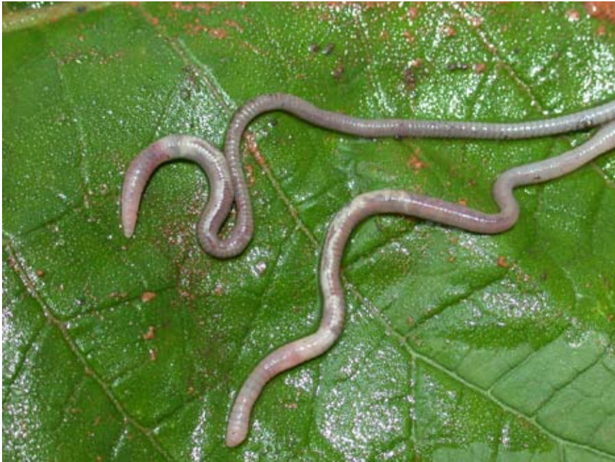
Figure 2. Two mature F. sporadochaetus . Note the long white seminal vesicles visible through the body wall.

tus is quite different from other Fimoscolex and the closely related Glossoscolex in having a copulatory chamber within the body wall rather than clearly distinct within the body cavity. From the location records now available for the species and genus (Table I), the potential range of the species may be much larger, considering the elevations and vegetation types from which it is known to occur. Clearly, the designation of extinct for F. sporadochaetus was premature, and did not include adequate fieldwork. The species is modestly sized with unremarkable features, and bears a superficial resemblance to the extremely common species, Pontoscolex corethrurus (Müller, 1857). Therefore it will not attract much attention, as would fall on the many giant earthworms known from southeastern Brazil, or those with bright coloration, or clearly different from worms commonly seen. Therefore, we expect that further exploration of the earthworm fauna of Minas Gerais, in the same general area, will yield more locations for F. sporadochaetus , as well as discovering many species previously unknown to science.